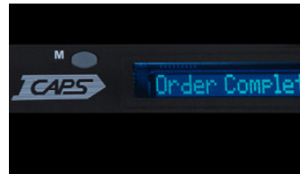
7. Zone Controller indicates order completion