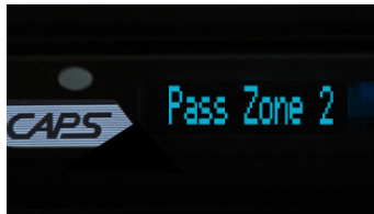
5. Zone Controller beeps and indicates where the order goes next