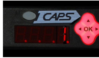
3. Lighted display indicates item and quantity to be picked