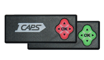
6. Color-coded bay lamps indicate different zones