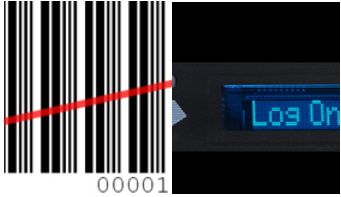
1. Picker scans badge to log on to system

Each Pick-to-Light system is easily customized for a particular fulfillment application; while details may differ, these steps indicate Pick-to-Light's common functionality across all applications.