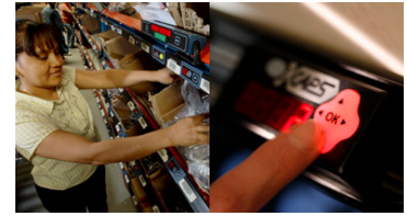
4. Item is picked; picker presses "OK" to verify completion of task